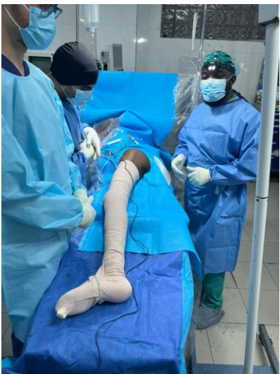
Surgeons in Haiti prepare for an operation. The patient is one of many in the island nation who require orthopedic surgery and who will benefit from the use of durable medical equipment provided by Food For The Poor’s generous in-kind donor Advocates for World Health.